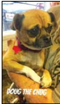
DOUG THE CHUG

Doug the Chug (Chihuahua/Pug) can climb a 6-foot fence in a heartbeat. We think he carries a pair of fence cutters but could not find them on him. No wonder then that he was in a rural pound. His next performance is even better. He has gone to live with