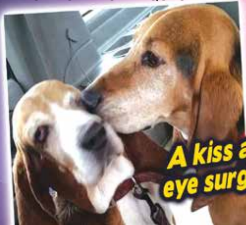
A kiss after eye surgery.

Matching Grant Doubles Every Dollar You Give till May 31