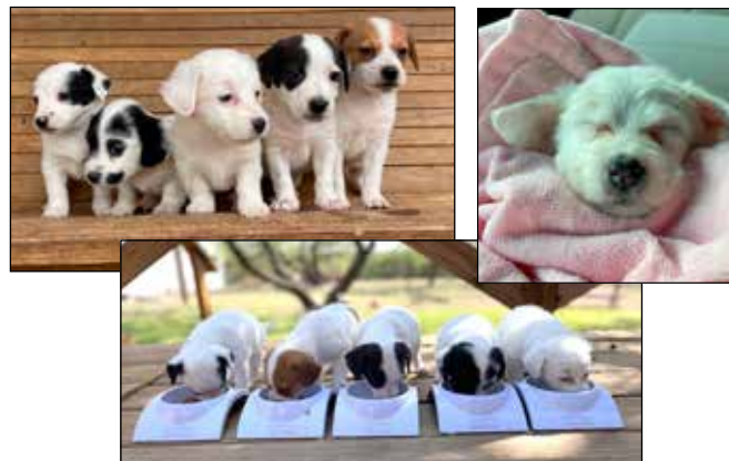
BORN IN BALLINGER

North Shore Animal League America is the largest no kill animal rescue and adoption agency in the world! We have partnered with them for over 10 years, saving hundreds and hundreds of homeless animals. Our latest group saw over 50 dogs from seizures and kill shelters saved by going to New York City.