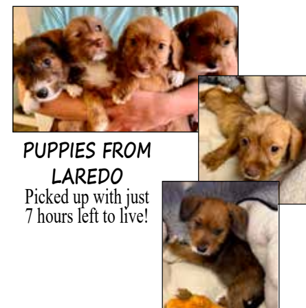
PUPPIES FROM LAREDO Picked up with just 7 hours left to live!