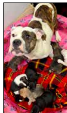
BULLDOG BETTY Abilene Animal Shelter to Wisconsin