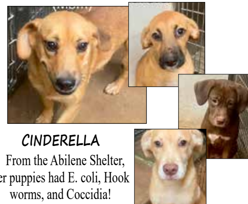
CINDERELLA From the Abilene Shelter, her puppies had E. coli, Hook worms, and Coccidia!